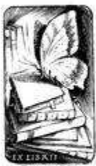
Donated by Houston Friends of the Library

RECYCLED BOOKS provided by the labors of the Friends of the Library. You can help your own personal literary goals as well as help the Houston County Libraries by getting on board with the Friends of the Library book recycling program. Houston Citizen's past book donations placed in the Friends donation boxes found their way to the Old Book Sale held annually in May. Houston County citizens flocked to the Sale and loaded up on book treasures of all kinds. One Book Sale patron was so excited that he was nearly skipping. "Guess what, he smiled!! I just bought an unbelievable amount of books for only $25.00. That is what I would have paid for only one (1) book at the ..... store" Then after the Old Book Sale, the Friends were able to turn around the profits to give $30,000 to the Houston Libraries. With all the budget cuts coming down from the State of Georgia that $30,000 may be all our libraries will have this year to buy new books.