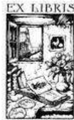
Donated by Houston Friends of the Library

LEARN THE USED BOOK BUSINESS! Come join us because the Friends only wish they could do more for the libraries. We are still a rather small group but welcome enthusiastic book lovers. Each