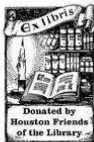
Donated by Houston Friends of the Library

were prepared for the Friends to designate these new purchases which came directly from the proceeds of the Old Book Sale. The circle of recycling repeats itself. Donate old books, buy old books at the Sale and new books will appear at your library.